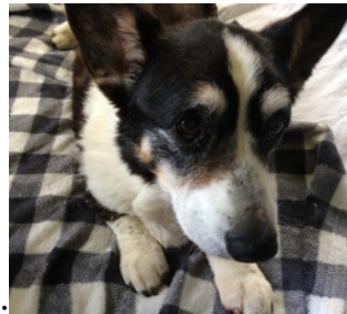
Bartley, my Corgi. He is 15 years old.