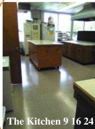
The Kitchen 9 16 24

In September, A Quality Facility Services came in to deep clean the floors in the Parlor, the kitchen, Fellow Ship Hall and the Opening Room downstairs. Wow! What a difference it made! Those of you who were able to come into the church the day after the floors were done were amazed at how great they looked. Stop in and see for yourself. This was all possible due to the joint support from the Historical Society who shared in the costs to have the work done at the church. We thank everyone involved. The church truly is a nice welcoming place for members and visitors.