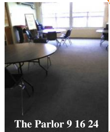
The Parlor 9 16 24